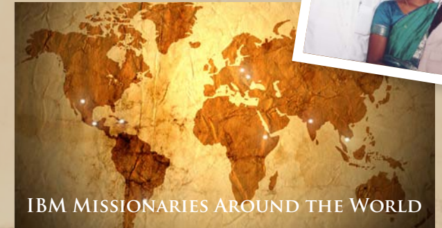
IBM MISSIONARIES AROUND THE WORLD